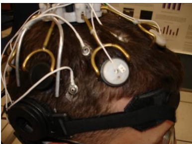
Figure 2. QUASAR's dry electrode system, with two offset wet electrodes corresponding to each dry electrode location at the 10-20 site.

To determine the spatial location of, and linear distance between, each electrode, a 3-D electromagnetic tracking system (3SPACE; Polhemus; Burlington, Vermont, USA; for reference, see He et al., 2007) with custom MATLAB software was used. Electrode locations were projected to the scalp surface (correcting for electrode thickness) for all distance calculations. As reported by He et al (2007), standard deviation in electrode position is approximately 1 [mm].